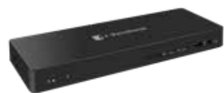
Dynaook Thunderbolt™ 4 Dock (PS0120LA1PRP)