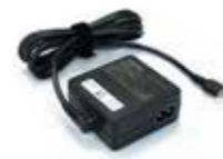
Additional dynabook Universal USB Type C™ PD AC Adaptor (PA5352E-1AC3)