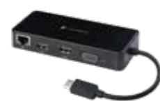
Dynabook USB-C™ to HDMI® / VGA / LAN / USB 3.0 Travel Adapter with Power Delivery (PD) Charging (PS0001UA1PRP)